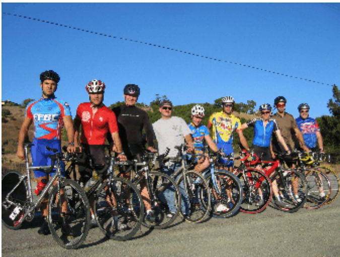
The group picture was taken after the individual time trial event.